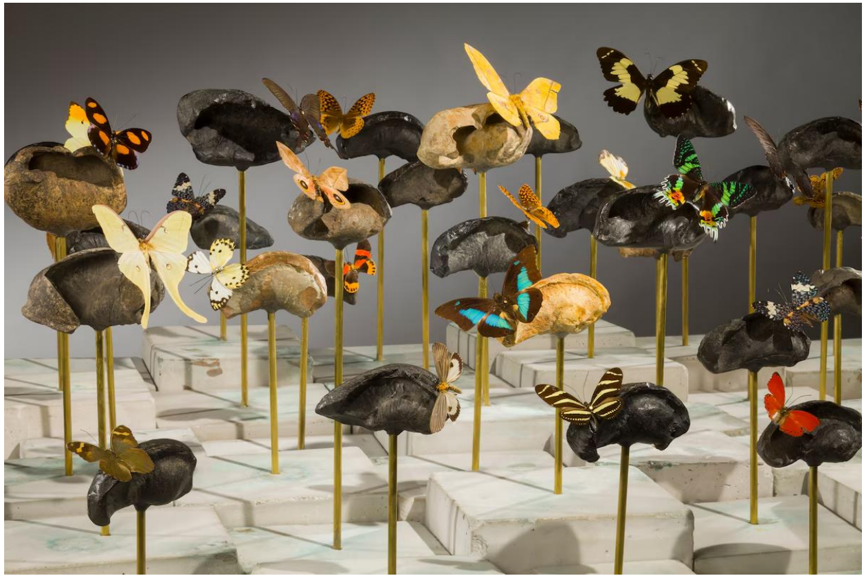
A detail view of Robleto's sculpture "American Seabed," 2014, made from materials including butterflies and fossilized whale ear bones. The antennae on the butterflies is made from audiotape of a Bob Dylan recording. (Dario Robleto)

To convey even more of the complexity of the Earth's history and human achievement, the record also contains coded images of reproduction and birth, DNA structure, eating and drinking, a Balinese dancer, Arabic writing, physical unit definitions, a family portrait, dolphins, and seashells. The images were recorded as audio waveforms after projecting them onto a screen and capturing them with a television camera. (The record's cover includes instructions to help decode the images, but how do you write instructions for life forms you know nothing about?)