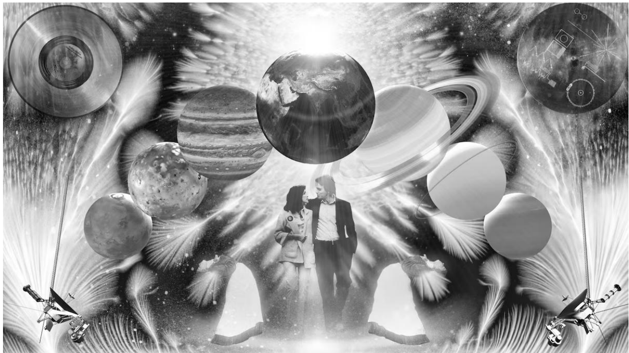
The film shows Ann Druyan, the creator of the Golden Record, and her husband, astronomer Carl Sagan.

Unfortunately, during the recording, he inhaled mustard gas, which so weakened his lungs that they couldn't handle the influenza virus then raging through Europe, and he died just weeks later. He had given his life to make a truthful document.