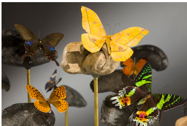
Detail of American Seabed (2014) by Dario Robleto.

observant, more detailed, and more importantly, more present with each other, that this can lead to new types of discoveries and forms of truth.” 2