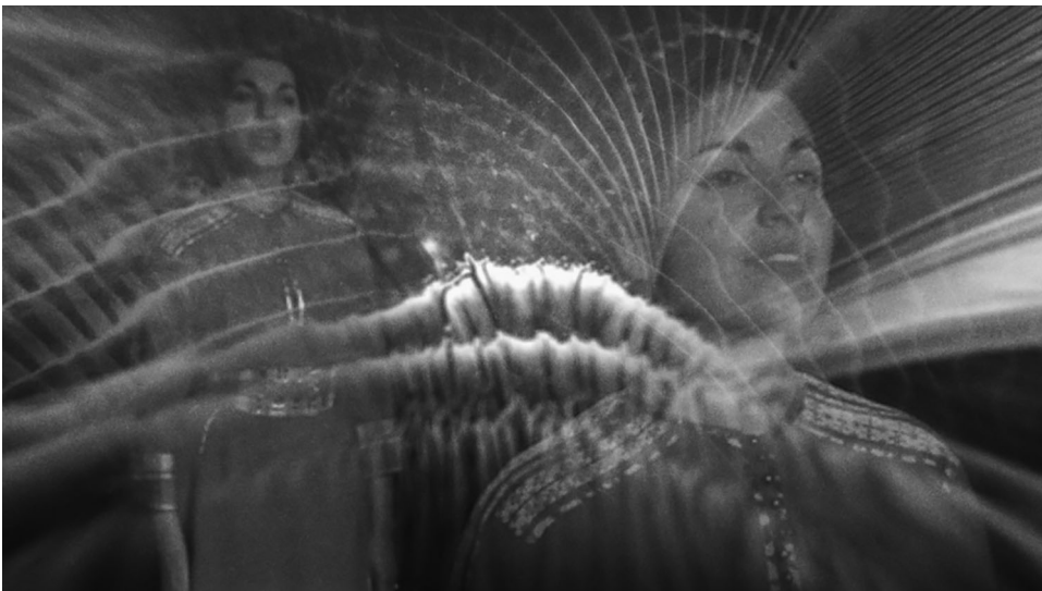
Still from The Boundary of Life is Quietly Crossed (2019) by Dario Robleto.

Decades before geometric abstraction and medium specificity would boldly signal an advance of consciousness in the history of modern art, the first pulse waves were tenderly, exquisitely traced by a single human hair on paper sooted by candle flame. Another early cardiological instrument recorded fetal heartbeats from the vibrating shadows of bubbles pierced by silver-coated quartz threads. Indeed, it might have been with these sensitive tools of medical imaging that the most avant-garde portrait of life was created. Do the methods of science seem poetically deficient to us today? Technology in its original sense, tékhnē , expressed a fundamental intimacy between making and doing, engineering and art. The Heart's Knowledge: Science and Empathy in the Art of Dario Robleto at Northwestern University's Block Museum of Art remembered this kinship by honoring several transformational episodes in the history of scientific recording as undeniably aesthetic